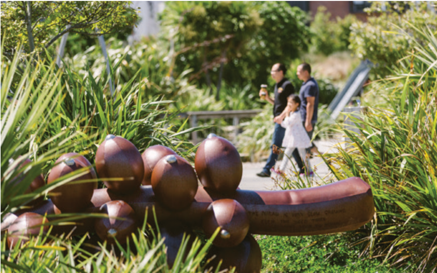
Hobsonville Point is home to a vibrant community with world-class amenities that make living both easy and enjoyable.

green fingers, you can grow your own produce in the communal vegetable gardens. Extensive cycling and walking trails hug the coast and parkways, giving you easy access to the scenic outdoors. Hobsonville Point is also home to two highly rated decile 10 schools – primary and secondary – alongside a growing retail and commercial hub. For commuters, Auckland City is an easy drive away, or catch the ferry to the CBD and arrive relaxed, whether you're heading to work or for dinner and a show.