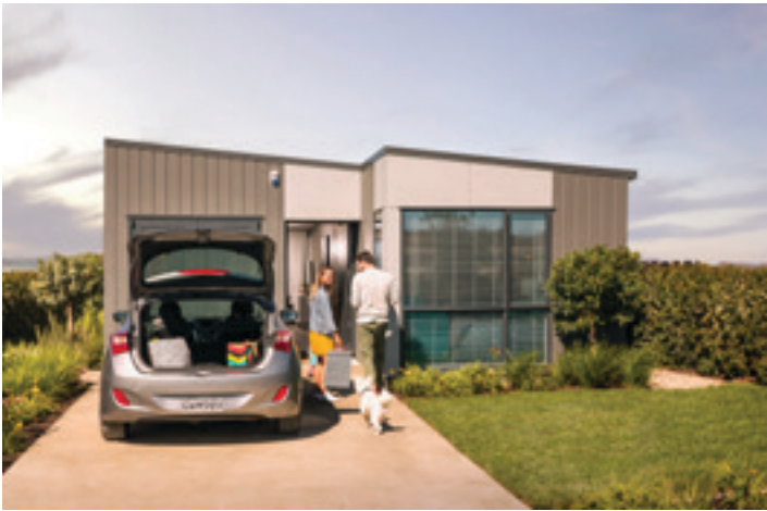
Lakeside, Te Kauwhata