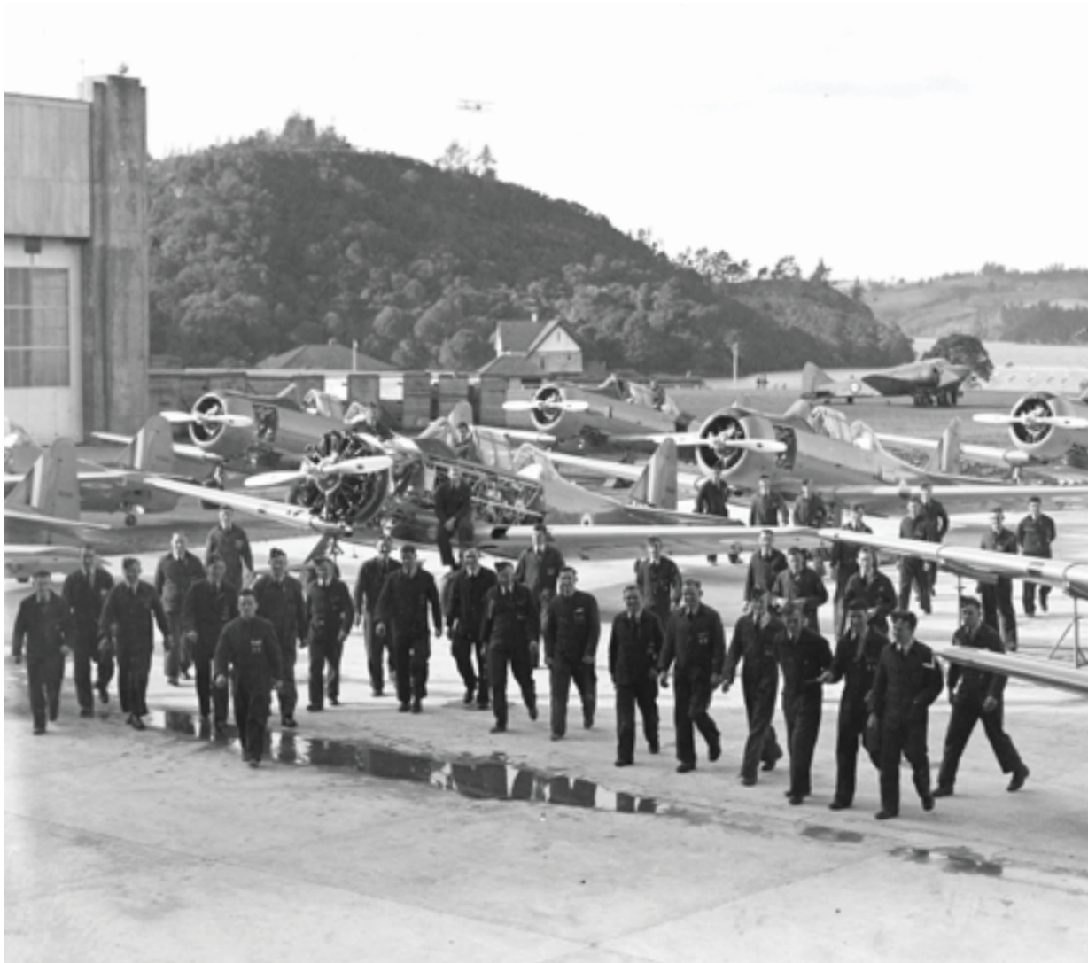
Launch Bay has a rich aviation and military history, from the impressive flying boats that once operated here to the large-scale aircraft hangars and the formal waterfront parade grounds.

Today, the historic Oval, once home to military parades and garden parties, is preserved as a common recreation space; the historic Seaplane and Sunderland Hangars have been transformed into stylish eateries, retail and office space, and the original Officers’ Houses are beautifully restored as contemporary homes.