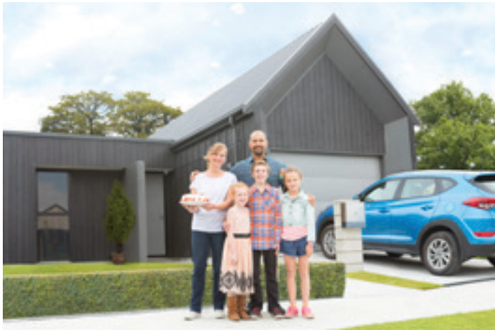
Bridesdale Farm, Queenstown

Winton’s vision is to set the standard as a world-class Australasian property group creating master-planned communities that are best by design. With a strong focus on customers’ needs, Winton provides a lasting legacy for generations to come by creating more sustainable, connected and vibrant urban communities.